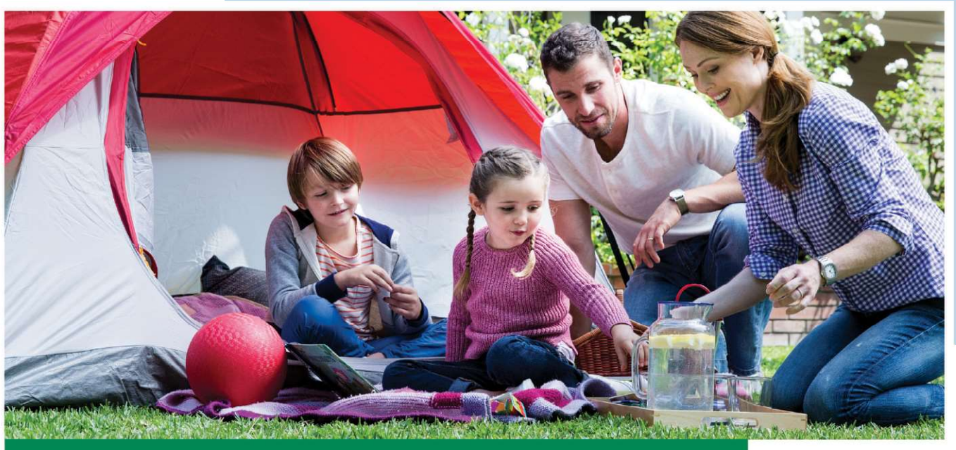
HOW TO FILE A CLAIM OR REQUEST A LEAVE